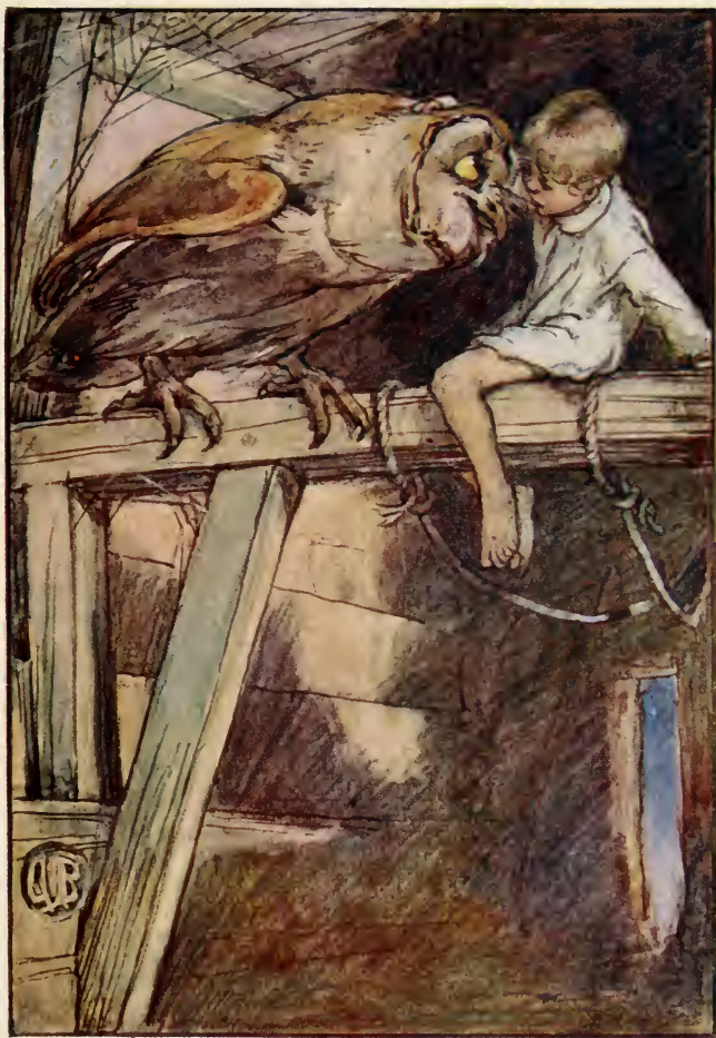
“ Kiss my fluffy face,” said the Owl (p. 22)